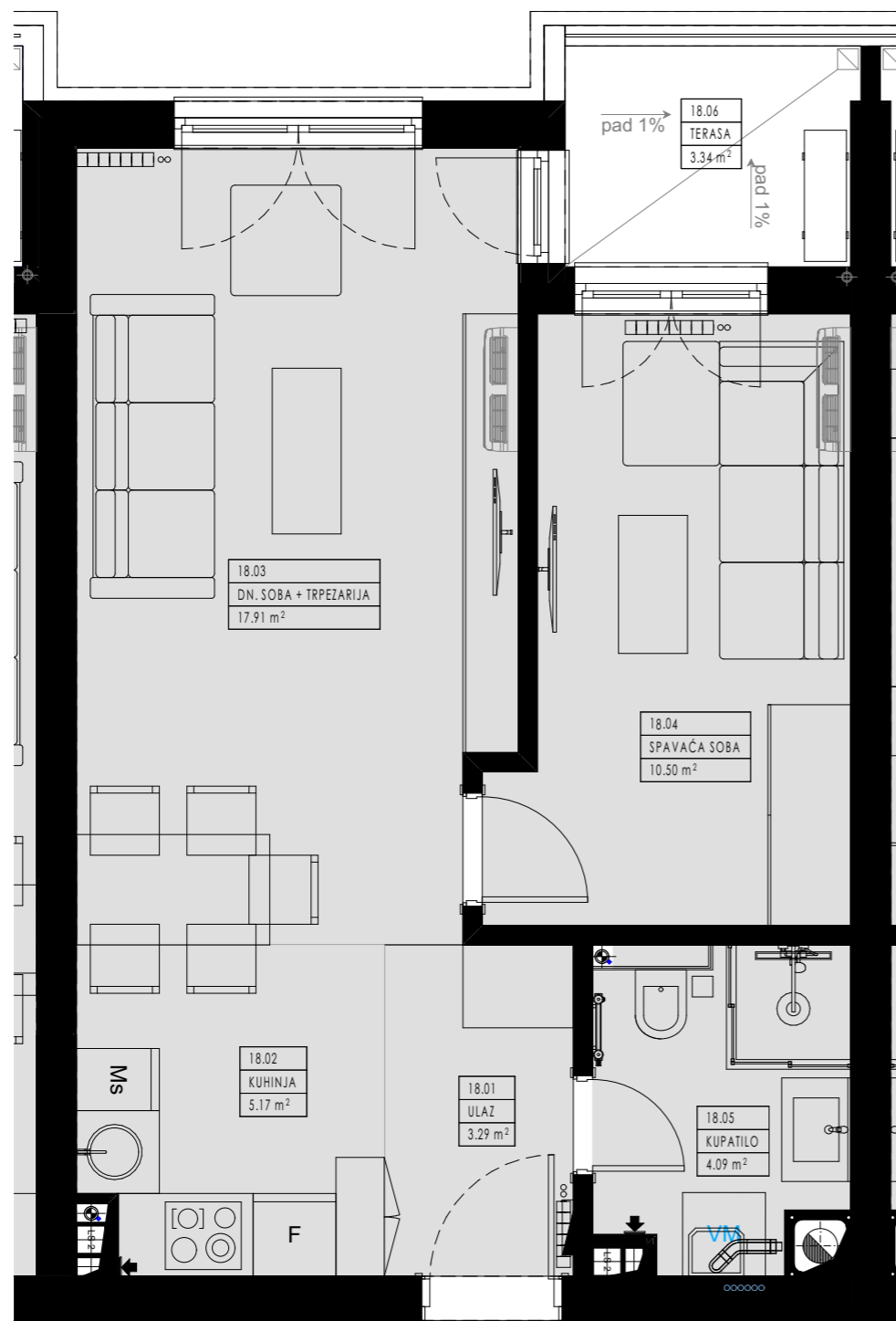
18,31,44,57,70 - 44,30m2